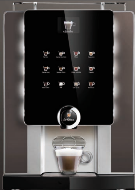
laRhea v+grande Our best seller!

Slim, compact, seductive 3 canisters for products, plus water for tea.