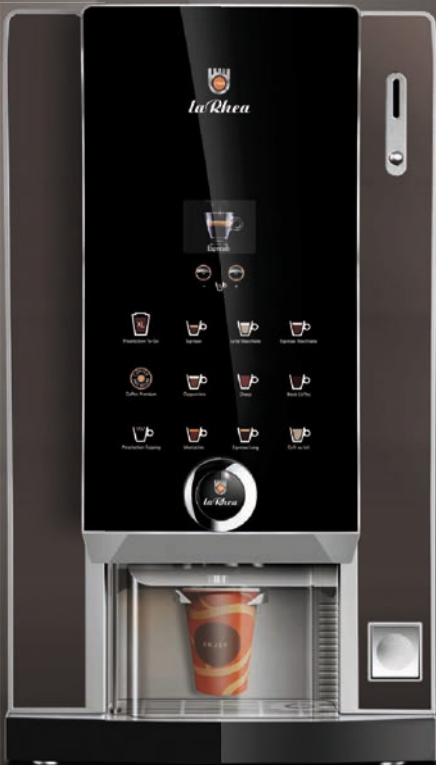
laRhea v+doppio & cup "To go" added value

All the advantages of the grande premium with the addition of a transparent hopper that holds two different types of beans. Whether dark or light roast, regular or decaf, Arabica or Kona, the choice is yours!