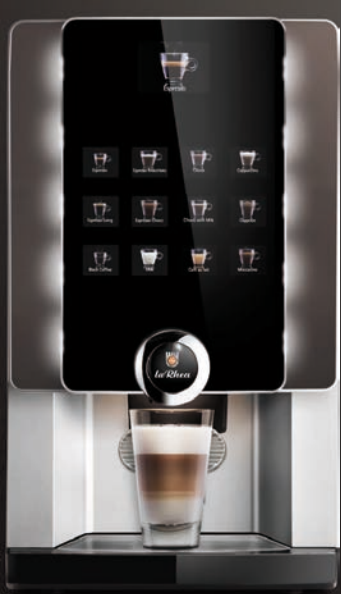
laRhea v+eC Compact first class

Slim, compact, seductive 3 canisters for products, plus water for tea.