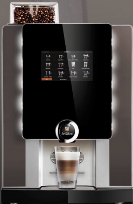
laRhea v+grande premium The magic touch

Hybrid technology with the Xtra canister for personalized products like Fairtrade Instant or lactose-free powdered milk.