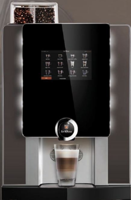
laRhea v+grande 2 premium State of the art

7" all-glass touch screen for an elegant, latest-generation interface, along with a visible hopper for coffee beans on top.